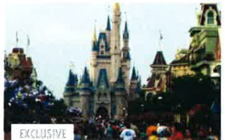
TAKING THE MICKEY Holidaymakers slam Disney World Florida after theme park tickets increase by a THIRD in just one year