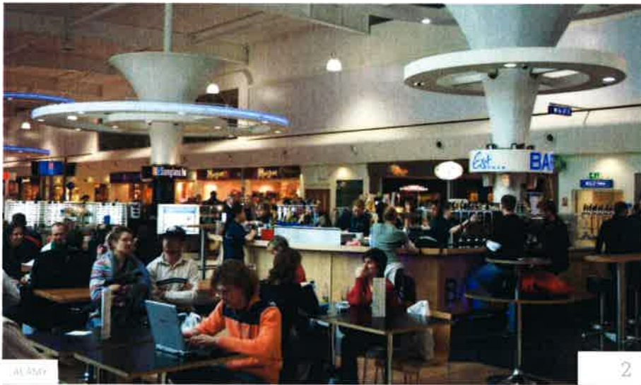
The House of Lords wants airport bars to be hit with restrictions on selling alcohol

The committee looked at a number of issues around licencing, but The Independent reported that a key concern was the fact that airport bars don't have to abide by rules set out in the Licensing Act 2003, which covers most drinking establishments in the UK.