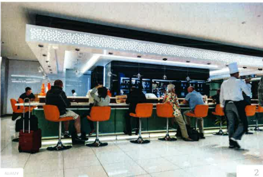
According to reports, a new study by a parliamentary select committee has concluded that the current rules around airport drinking lead to dangerous situations

The company spokesperson claimed that more than half of the incidents with passengers behaving badly on their aircraft had been fuelled by alcohol.