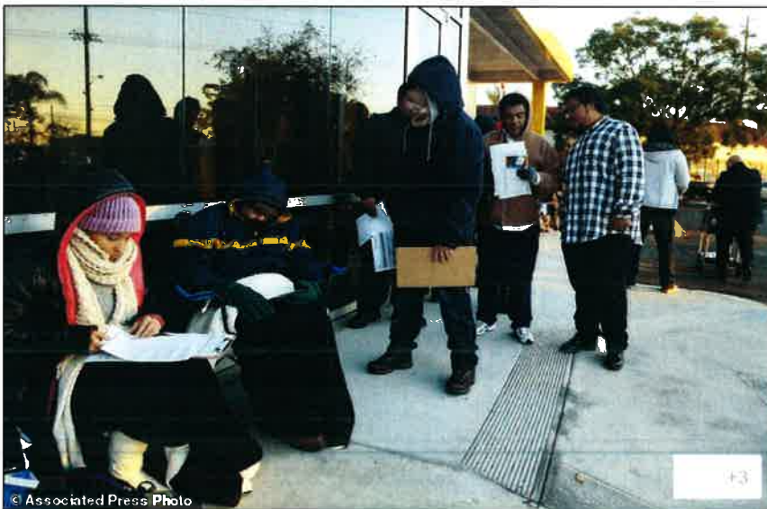
FILE - In this Jan. 2, 2015 file photo, immigrants line up after spending the night outside a California Department of Motor Vehicles office to register for drivers licenses in Stanton, Calif. Granting driving licenses to 600,000 people living in California illegally reduced the likelihood of hit-and-run accidents, according to a new study released Monday, April 3, 2017, by the Proceedings of the National Academy of Sciences.

Jens Hainmueller, faculty director of the policy lab, said the study was conducted because of a lack of data when California debated its law that went into effect on 2015.